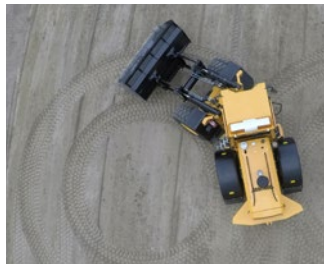
45 degree steering angle