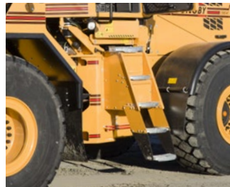
Best instep to the cabin on the market.