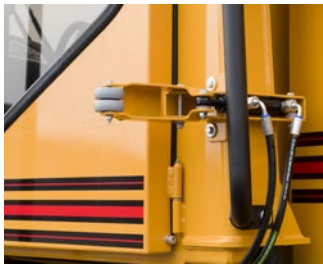
Electric door closers