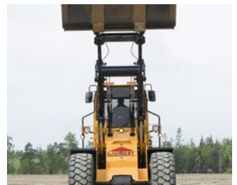
Free sight stand which gives you superior control over your gear and the area around the machine.