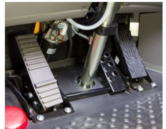
Electrically adjustable pedals for optimal driving position