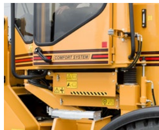
LM Comfort (cab suspension). Our own Comfort System.

Contact your Ljungby seller for more information how to get together a Superior Performance machine for you.